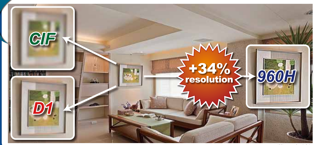
All Pictures are Sample Only

KGUARD provides a new digital video recorder with 960H recording resolution. 960H recording resolution gives you HD quality videos and images with 600TVL cameras. Its resolution is 34% higher than standard D1 resolution and 500% higher than CIF resolution. You don't need to worry about the video or image becoming unclear or losing important information.